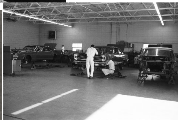
First use of mid-size on the big ovals & it was a Cyclone during MFG pull out - Being prepped - having started with a real car.