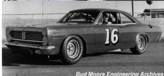
Bud Moore Engineering Archives