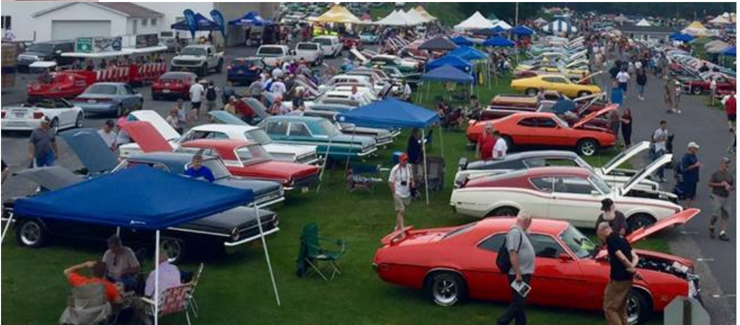
Another view of the intermediate row @ Ford Carlisle- always the 1 st week in June- if you can only make one show in a year - this is it!