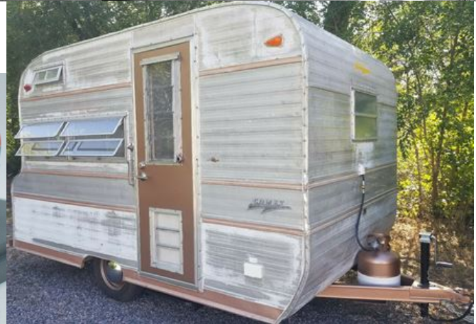
Our noncar Comet is a 1963 camper on eBay :