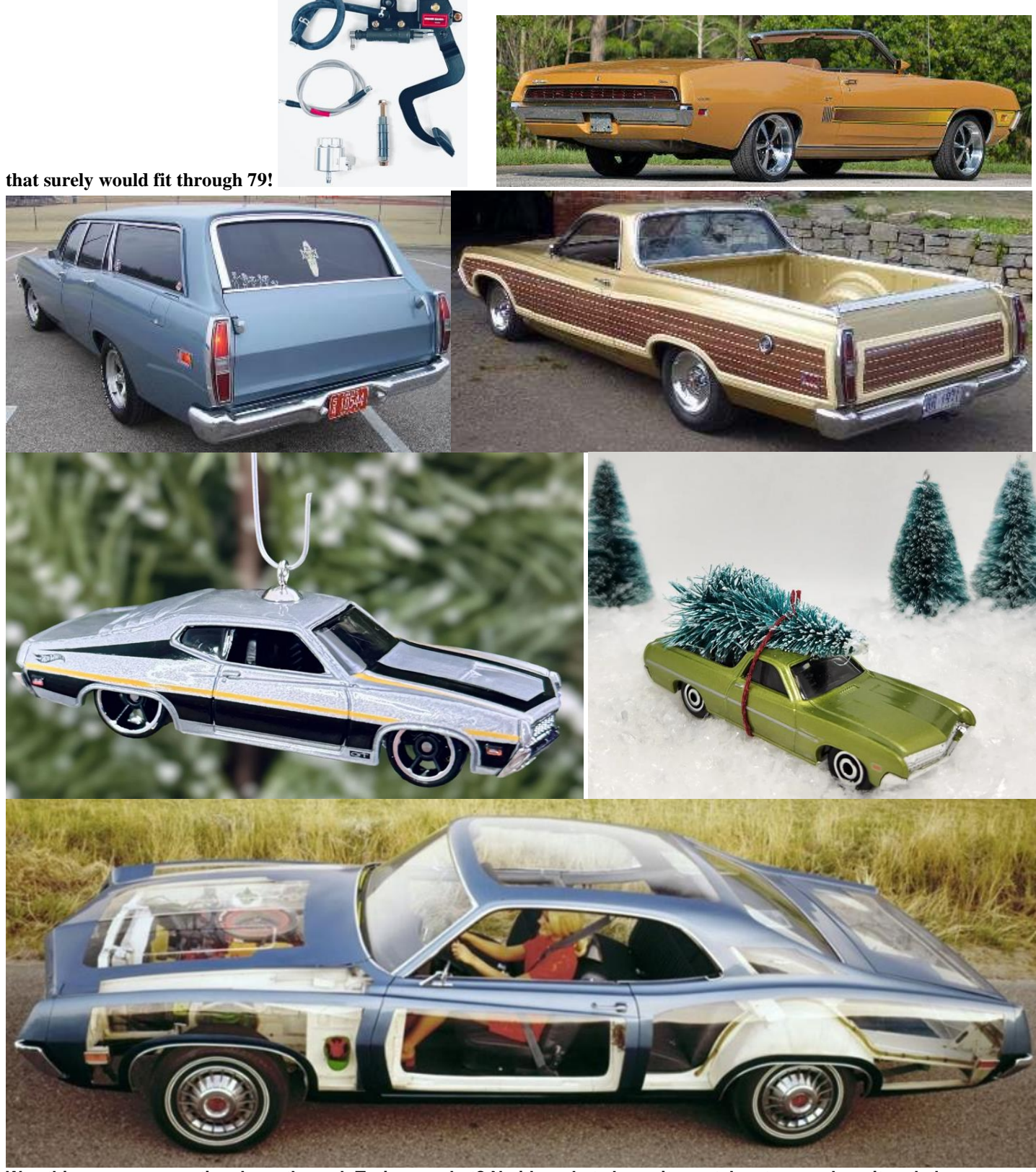
Was this a crazy promotional see-through Torino or what? No idea what shows it was taken to nor where it ended up.

Restoration help: Malwood makes hydraulic clutch units for about everything midsize blue oval. Just released one for 72-76