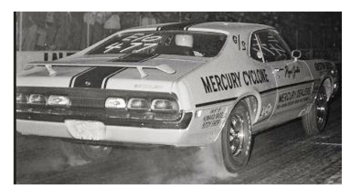
Our noncar Cyclone is a 5<sup>th</sup> wheel camper: