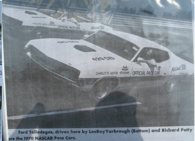
Ford Talladegas, driven here by LeeRoy Yarbrough (Bottom) and Richard Petty are the 1970 NASCAR Pace Cars.